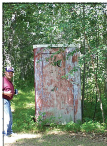
Corvaair Parts storage?

And another member not to be mentioned, May or may not be the owner of a Corvaair Powered trike. We'll all have to wait to see it the stories are both true or false.