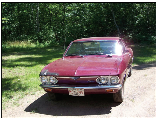
This may, or may not be the car LOL

THANKS EVERYONE, SEE YOU AT THE MEETING!!!