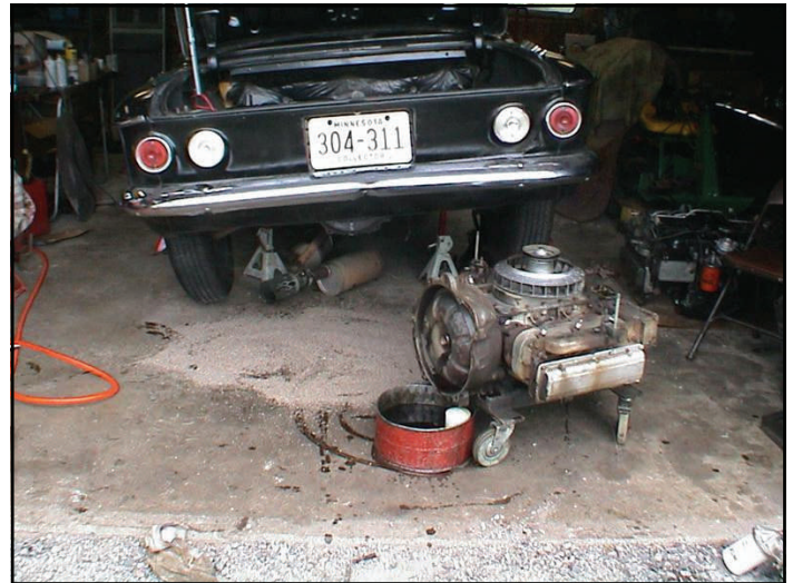
The old engine out and on the floor!!