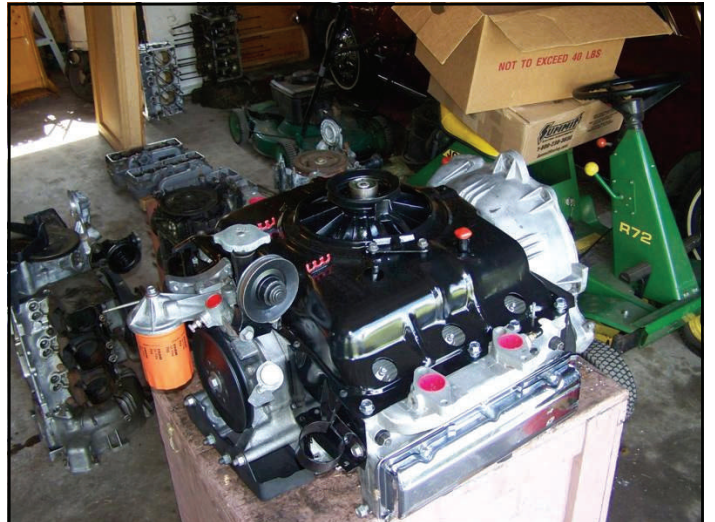
In my garage getting ready to make the swap.