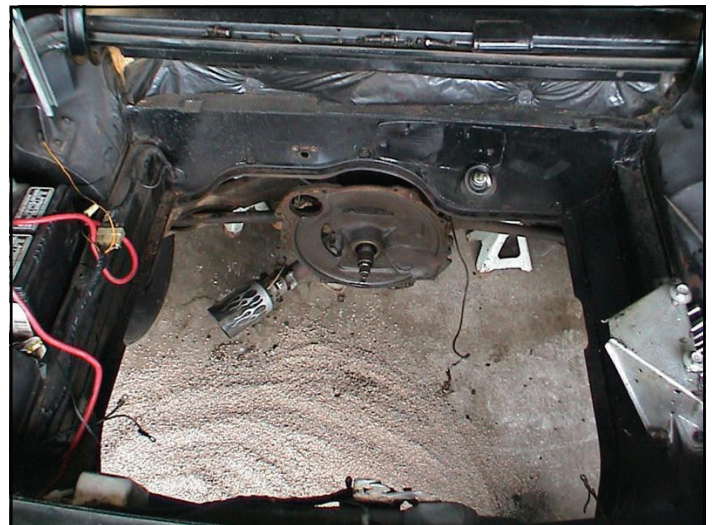
Ready for the new rebuilt engine.